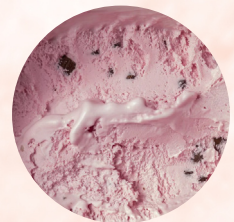
#78085 RASPBERRY TRUFFLE