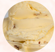
#78048 BUTTER PECAN