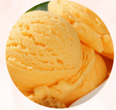
#74336 SHERBET ORANGE