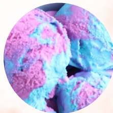
#78063 COTTON CANDY