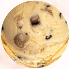
#78049 CHOCOLATE CHIP COOKIE DOUGH