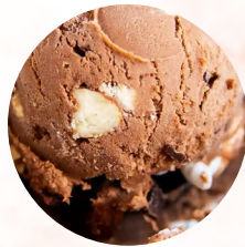
#78054 ROCKY ROAD