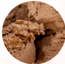
#74522 CHOCOLATE PEANUT BUT- TER