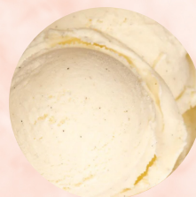
#78888 VANILLA BEAN