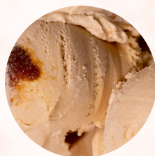
#78162 CARAMEL COMBUSTION