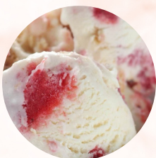
#78130 STRAWBERRY CHEESECAKE