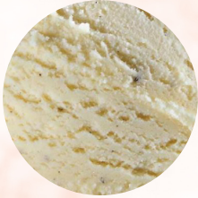
#70202 BANQUET VANILLA