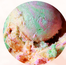
#78036 RAINBOW SWIRL