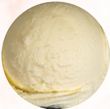
#74521 FRENCH VANILLA