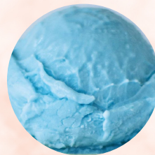
#78083 BLUE MOON