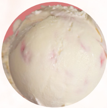
#78053 PEPPERMINT STICK