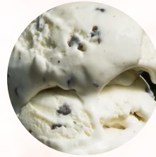
#78051 MINT CHOCOLATE CHIP