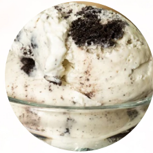
#78050 COOKIES AND CREAM